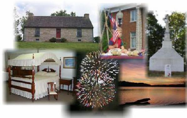
Images of Taylor County

Green River Lake - Green River Lake is a haven for the water sport and fishing enthusiast as well as the vacationer that just wants to get away from the hustle and bustle of every day life. This 8,200-acre lake offers over 33 miles of picture perfect water lying between 250 miles of shoreline. With an average depth of 50 feet and at its widest point 1 mile across, it is just perfect for fishing, skiing and riding your personal watercraft or just relaxing in one of the many houseboats, small craft, floating cabins, and condominiums available for rent.